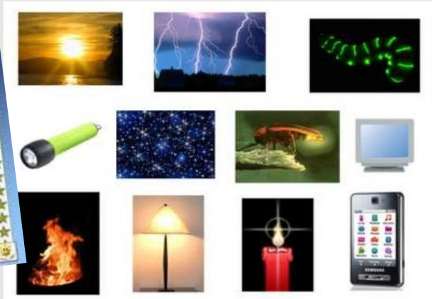
Which are Natural or Artificial Sources of Light?

The Big Question: What is Diwali? How is it celebrated?